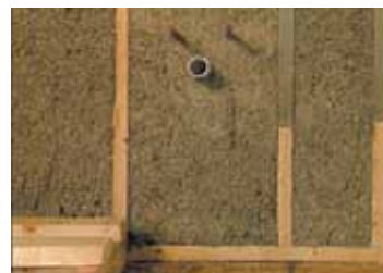
Nu-Wool WALLSEAL eliminates gaps and air pockets.