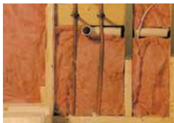
Gaps and air pockets are common with fiberglass insulation materials.

R-value** is the measure of how well an insulation product resists the flow of heat or cold. Some insulation materials, through installation, have more leaks - reducing the "Effective R-value." Nu-Wool Premium Cellulose Insulation, when properly installed, greatly reduces air leakage, providing a superior R-value in "real world" environments, where it counts. Nu-Wool's higher "Effective R-value" results in energy savings of up to 40%* compared to fiberglass insulation.