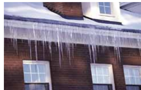
Ice damming can be minimized by insulating your home with Nu-Wool Premium Cellulose Insulation.

The preferred method of preventing ice dams in non-cathedral roofs is to properly ventilate and insulate. Energy efficient roofs minimize problems with ice dams because they keep the entire roof cold. There is little difference in temperature between the part of the roof inside the perimeter of the outside walls and the part covering the eaves or overhangs. Thus, melting and refreezing is minimized. Insulating to prevent heat leaks and sealing against air leaks between the inside of the building and the attic are the best ways to achieve a cold roof. Ventilation of the attic may help to achieve a cold roof. Its primary purpose, though, is to prevent moisture from condensing in the attic on the underside of the roof decking and dripping down into the insulation. Any warm air leaking from the inside of the building into the attic carries moisture with it. Sealing the air leaks is usually more effective than increasing the ventilation.